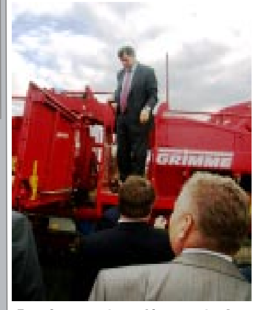
From Governors to machine operators! Kaluga Region Governor A. Artamonov is pleased with the performance shown by the new potato-harvesting machines in Kaluzhskaya Niva .

5. My Native Village and My Home (Send us photos featuring the most interesting moments in the life of your native village)