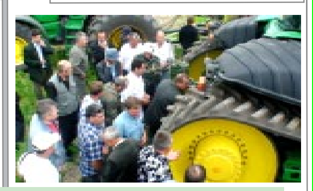
This is what I call power! The first JD tractor in the Siberian Region was at the centre of everybody's interest during Field Day.

will be published in EkoNiva-News and awarded prizes. They will also be included in the exposition of the most striking works to be exhibited in Moscow in October.