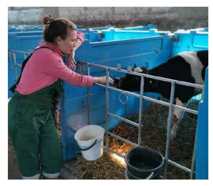
or several months, new dairies located in Ryazan and Orenburg oblasts –